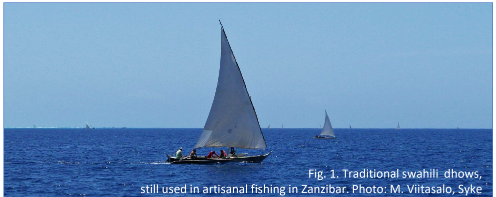
Fig. 1. Traditional swahili dhows, still used in artisanal fishing in Zanzibar.

People of Zanzibar are dependent on the ocean and its resources (Fig. 1), and blue economy is envisioned as a driver of economic and social development. This development needs to be sustainable. If the usage of the sea surpasses its carrying capacity, the resources will be depleted, and blue growth reverses to a blue decline.